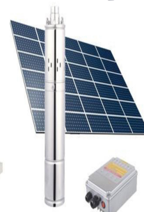
Solar Water Pump