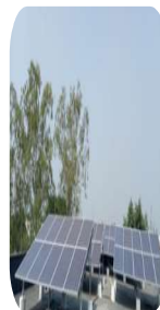
400 KWP RCC Roof-Top, (Indore, Bhopal, Jabalpur) Madhya Pradesh