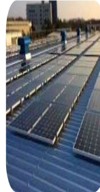
800 KWP Tin Roof-Top Nagpur