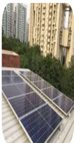
550 KWP Tin Roof-Top Dholpur (Rajsthan)