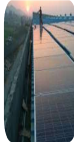
800 KWP "RCC & Tin" Roof-Top Lucknow (U.P.)