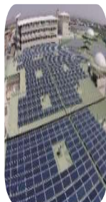
1 MWP Combined (G.R.T) Karnal (Haryana)