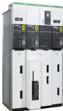
HT BREAKER PANEL