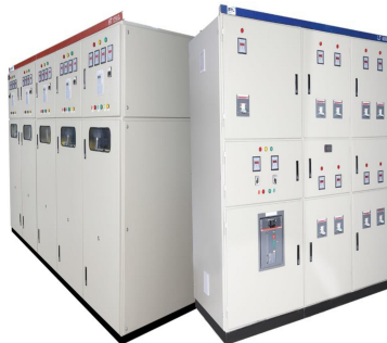
POWER CONTROL (PCC) PANEL