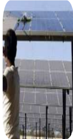
60 K SPV Project Greater Noida