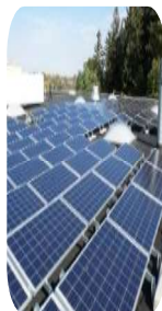
1.2 MWP RCC Roof-Top Lucknow (U.P.)