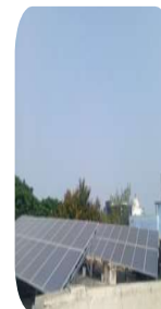
59 KWP RCC Roof-Top (Nizamudin) Delhi NCR