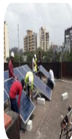
51 KWP RCC Roof-Top Gurugram