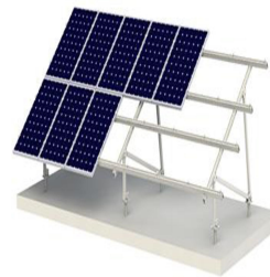
Solar Module Structure