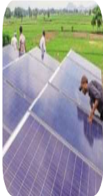
30 K SPV Project Noida