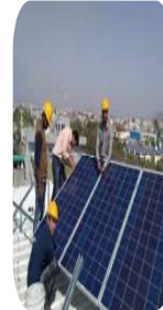
26 KWP RCC Roof-Top Pali (Rajsthan)