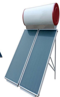
Solar Water Heater