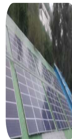
104 KWP Tin Shed (Ghaziabad) Uttar Pradesh