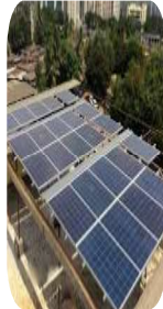
15 K SPV Project Haryana