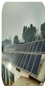
331 KWP Tin Roof-Top Bhiwadi (Rajsthan)