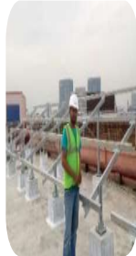
45 KWP RCC Roof-Top Noida