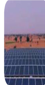
800 KWP Ground Mounted Nawa (Rajsthan)