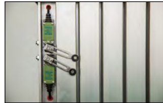
Double Limit Switches