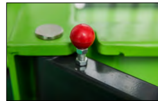
Limiting Screw for Outriggers