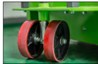
Red PU Wheel