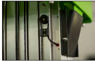
Buckle Plate for Platform Guardrail