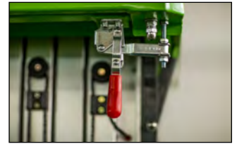
Fixture for Platform Guardrail