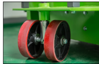
Red PU Wheel