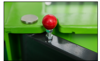
Limiting Screw for Outriggers